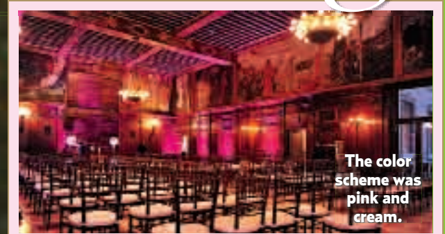
The color scheme was pink and cream.