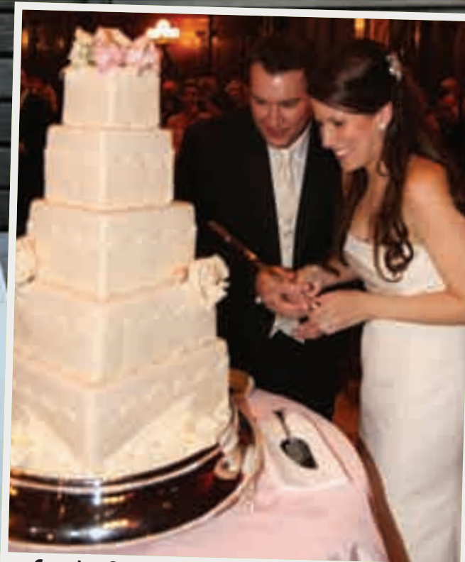
Cupcakes Couture of Manhattan Beach, CA, which has provided confections for Courteney Cox, created the cake.

Stem Design filled the space with roses and hydrangeas; Wiley Valentine did the invites and menus.